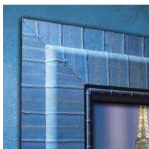
WINDOW IN GENUINE LIGHT BLUE EEL SKIN