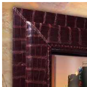
WINDOW IN GENUINE BROWN CROCODILE LEATHER