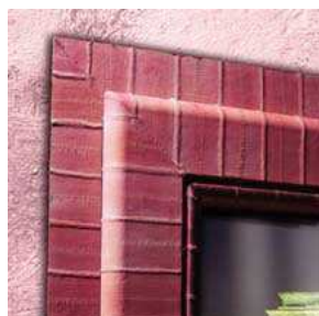
WINDOW IN GENUINE PINK EEL SKIN