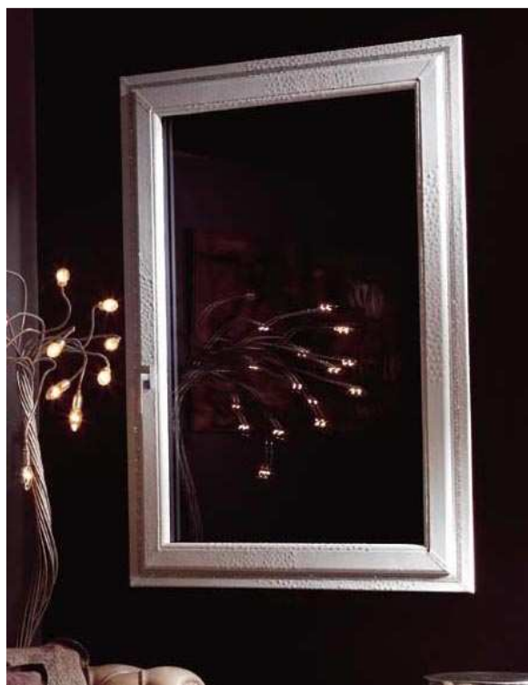
WINDOW IN GENUINE WHITE OSTRICH LEATHER