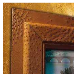
WINDOW IN GENUINE OCHRE OSTRICH LEATHER